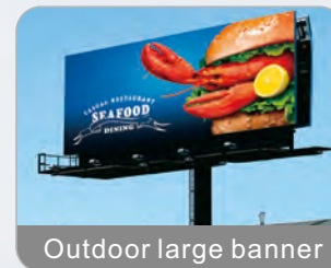
Outdoor large banner